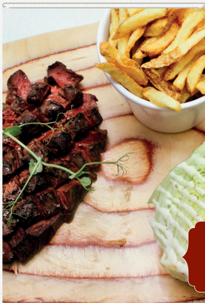
Magret de canard cadrillé