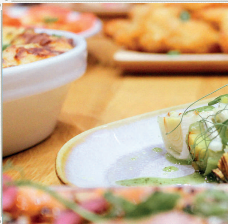
Leeks vinaigrette with mimosa-style egg