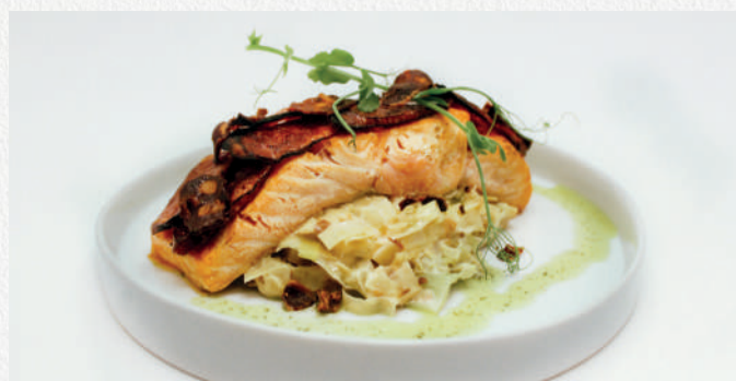
Salmon fillet with bacon crisps