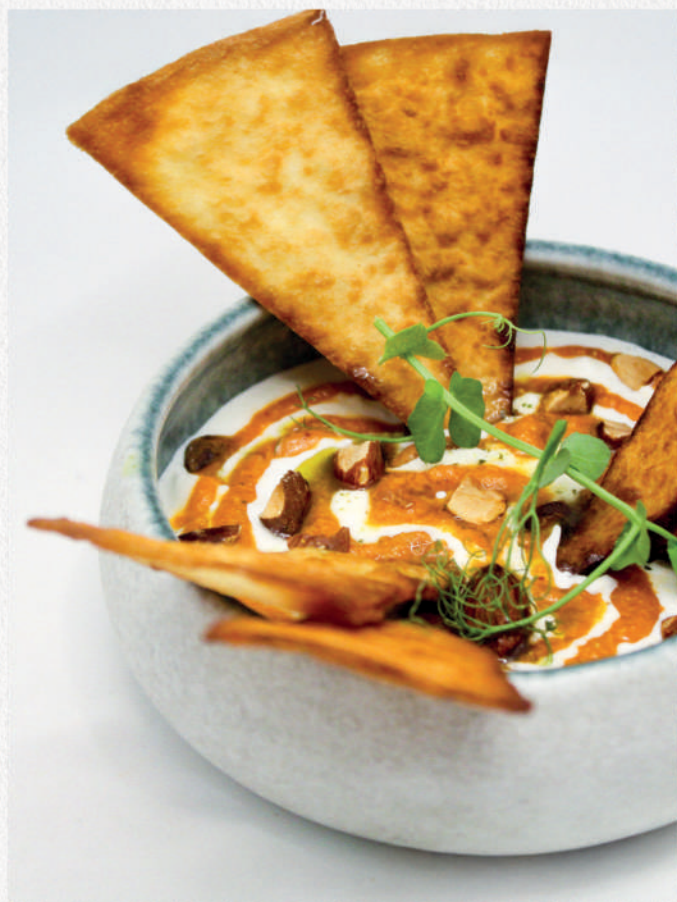
Stracciatella with pesto rosso