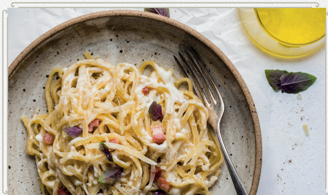
Pasta of the week - homemade Carbonara

Every day brings something new : a different daily special, a pasta recipe that changes every week, and a butcher's cut that evolves regularly depending on arrivals.