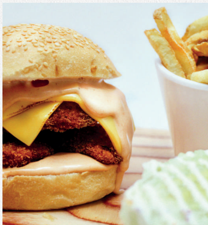
100% Homemade Chicken Burger