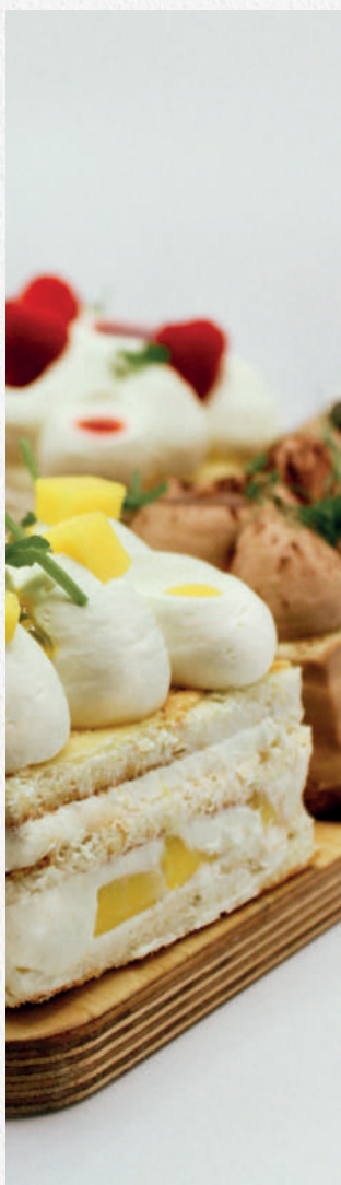
Dessert from our pastry chef

MENU Starter included + Main course Choice starter: Little gem lettuce with seasonal garnish or Seasonal velouté Choice of main course: Dish of the day or Pasta of the week or Butcher's cut + 2 €