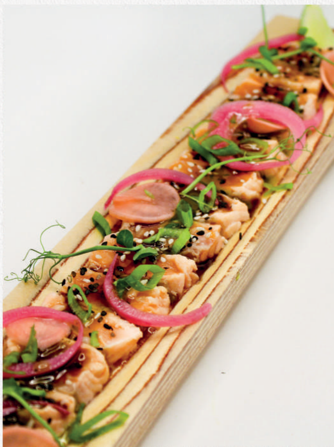
Salmon tataki with teriyaki sauce