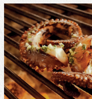
Roasted octopus tentacle