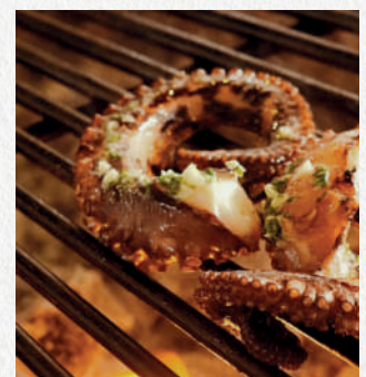
Roasted octopus tentacle