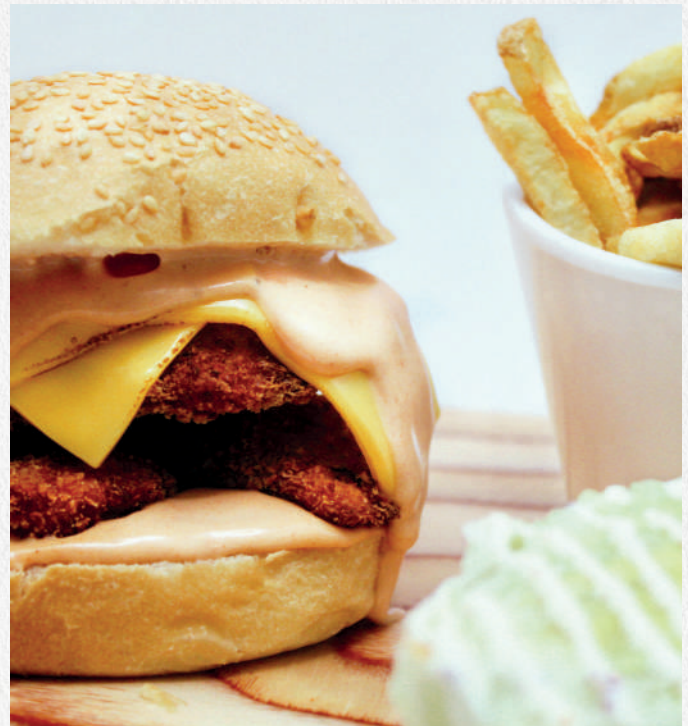
100% Homemade Chicken Burger